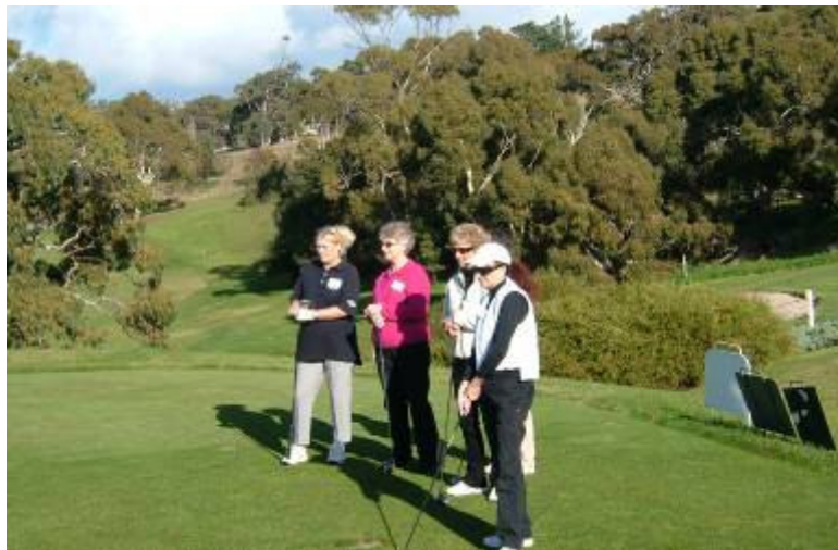
Ladies Come and Try Golfers Some of the Ladies Come and Try golfers experiencing that terrible first moment on the first tee.